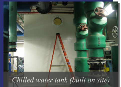
Chilled water tank (built on site)