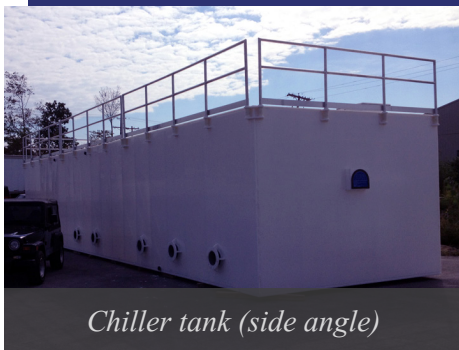
Chiller tank (side angle)